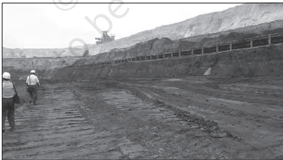
Fig.7.4 : Neyveli Coalfield