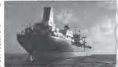
Export of high-grade iron ore has been to rail channelled through the Minerals and Metals Trading Corporation Ltd. (MMTC), and quantitative restrictions were imposed by the Government to ensure that indigenous demand was met before any surplus could be exported. However a shift in this policy is expected.

While iron ore is a major component of the steel manufacturing process, scrap is often used to supplement it, though it is in relative shortage in India. The steel industry is a major employer in the country, and its growth is a key indicator of the country's economic development. The government has taken several steps to promote the growth of the mineral sector under the overall framework of the National Mineral Policy, 1993. The amended Mines and Minerals Development and Regulation Act (MMDRA) is aimed at attracting private investment and foreign direct investment (FDI) into the sector. It is estimated that the production of iron ore during the second year of the Tenth Plan (2000-07) will touch 110 mt, with around 40 mt exported annually during the Plan period. The Government also regulates the amount of iron ore to be extracted to ensure sustainable. Modern excavation technology techniques have been developed which help minimise damage to the environment.