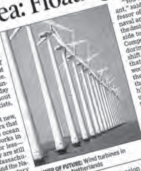
POWER OF FUTURE: Wind turbines in Drontien, the Netherlands

Offshore wind turbines are not new, but they typically stand on towers that have to be driven deep into the ocean floor. This arrangement only works in water depths of about 50 feet or less. Close enough to shore that they are still visible. Researchers at the Massachusetts Institute of Technology and the National Renewable Energy Laboratory (NREL) have designed a floating platform that can be attached to a concrete or steel cable system on the ocean floor. The setup is called a "tension leg platform," or TLP, and would be cheaper than fixed towers.