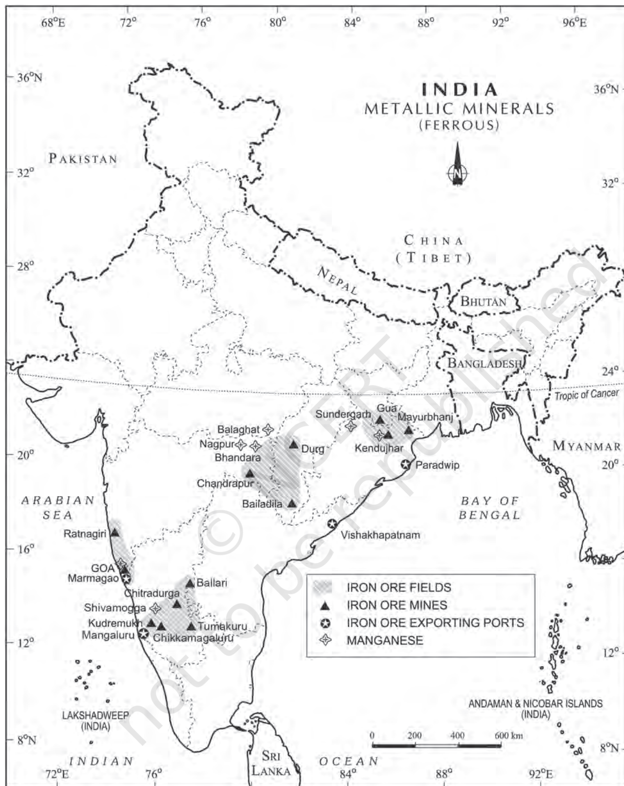
Fig. 7.2 : India – Metallic Minerals (Ferrous)