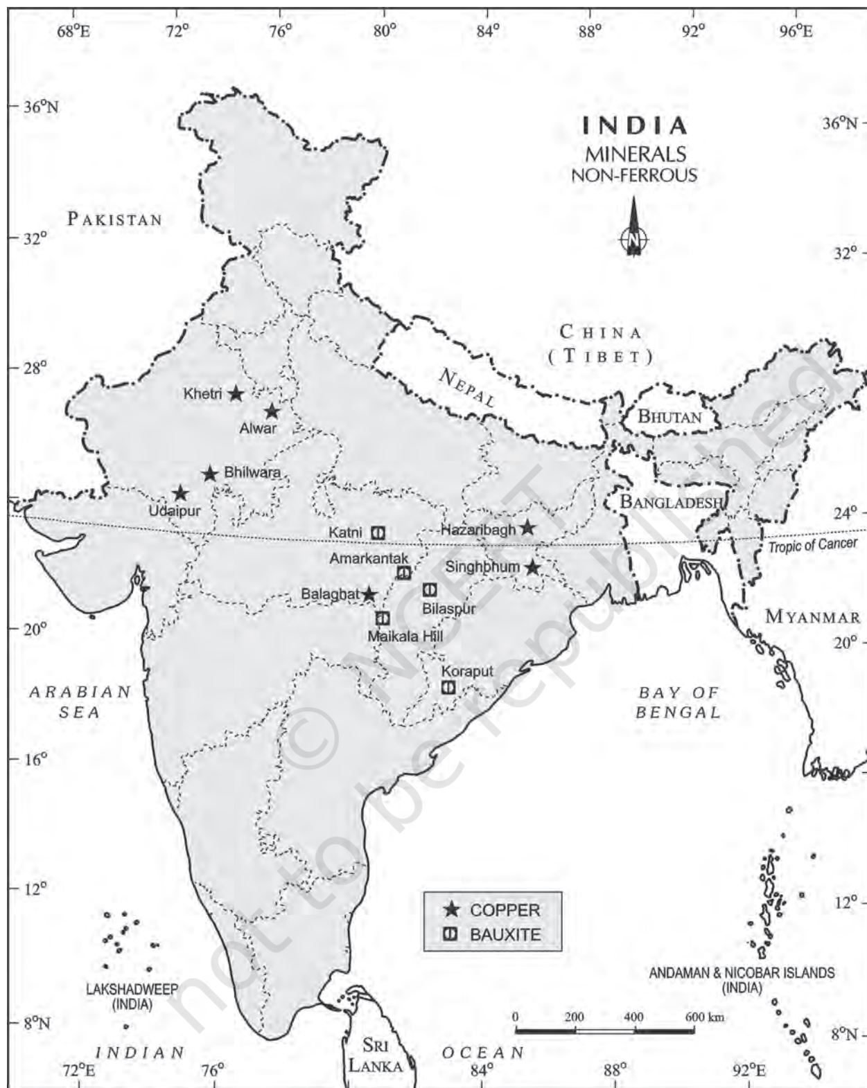
Fig. 7.3 : India – Minerals (Non-Ferrous)