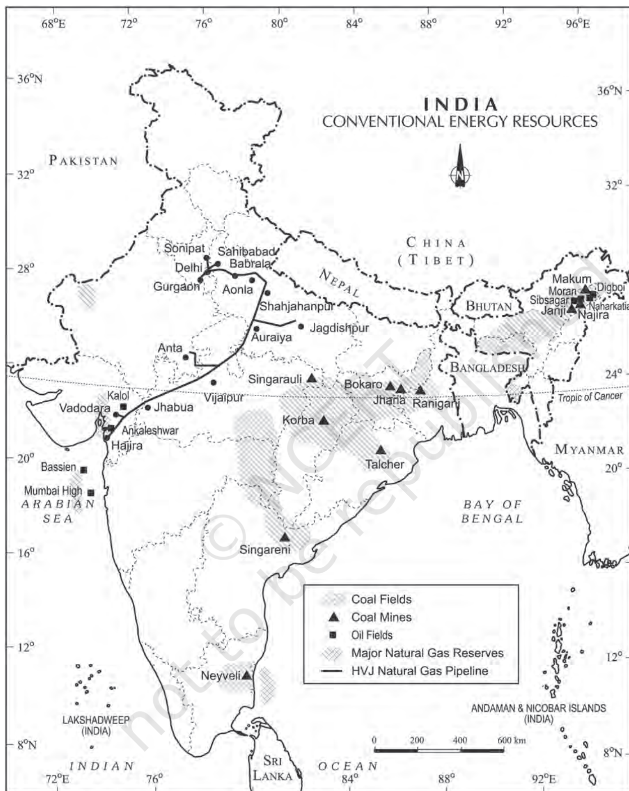
Fig. 7.5 : India – Conventional Energy Resources