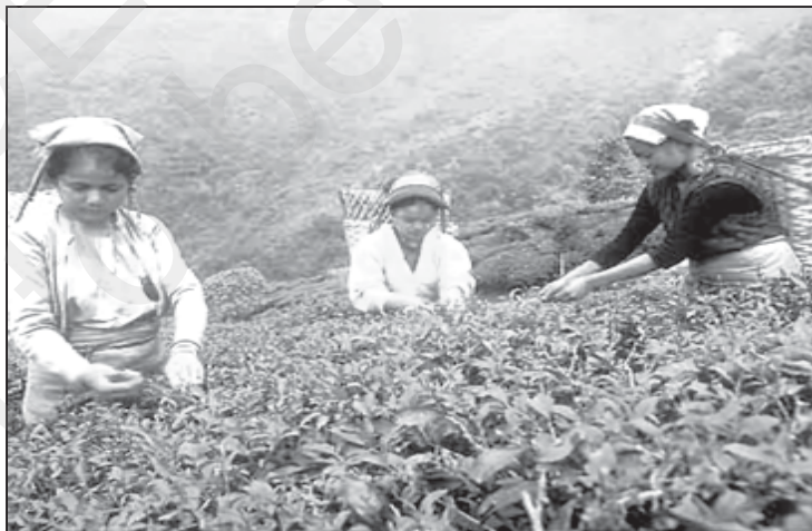
Tea pickers in Assam

Other changes have also redefined the nature of sociology and social anthropology. Modernity as we saw led to a process whereby the smallest village was impacted by global processes. The most obvious example is colonialism. The most remote village of India under British colonialism saw its land laws and administration change, its revenue extraction alter, its manufacturing industries collapse.