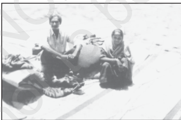
A homeless couple

The facts of contemporary history are also facts about the success and the failure of individual men and women. When a society is industrialised, a peasant becomes a worker; a feudal lord is liquidated or becomes a businessman. When classes rise or fall, a man is employed or unemployed; when the rate of investment goes up or down, a man takes new heart or goes broke. When wars happen, an insurance salesman becomes a rocket launcher; a store clerk, a radar man; a wife lives alone; a child grows up without a father. Neither the life of an individual nor the history of a society can be understood without understanding both... (Mills 1959).